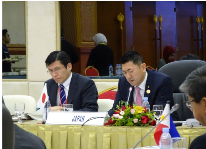
the 11th ASEAN+Japan Telecommunications and Information Technology Ministers Meeting (1)