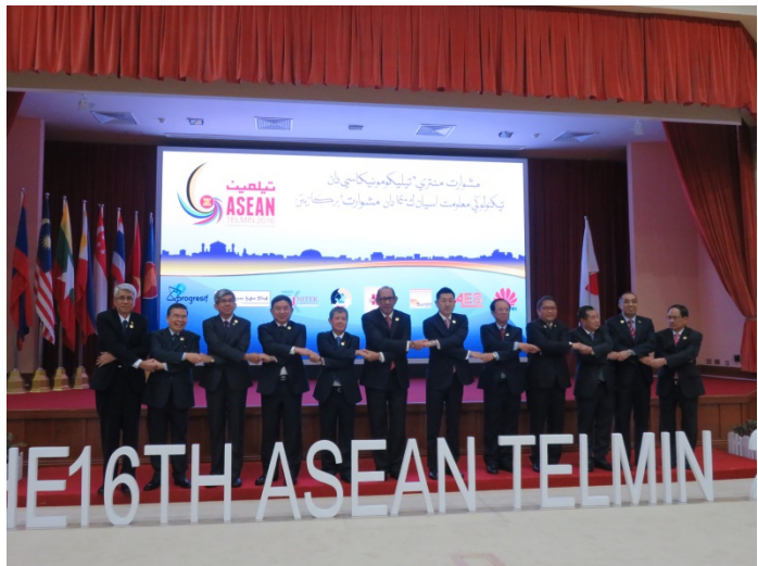
the 11th ASEAN+Japan Telecommunications and Information Technology Ministers Meeting (2)